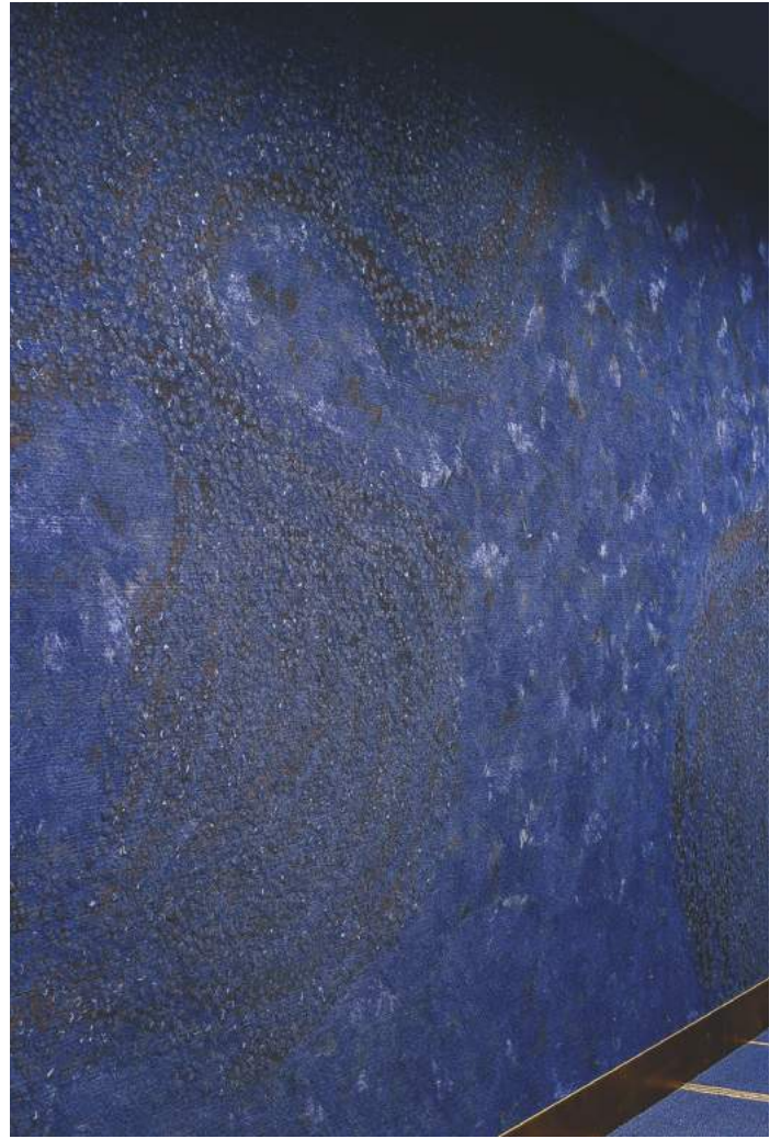
Lamontage® techniques used here are marble, fossette, and painterly.