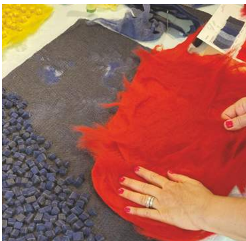
Design begins with a handmade sample, created in our NYC studio at The New York Design Center.