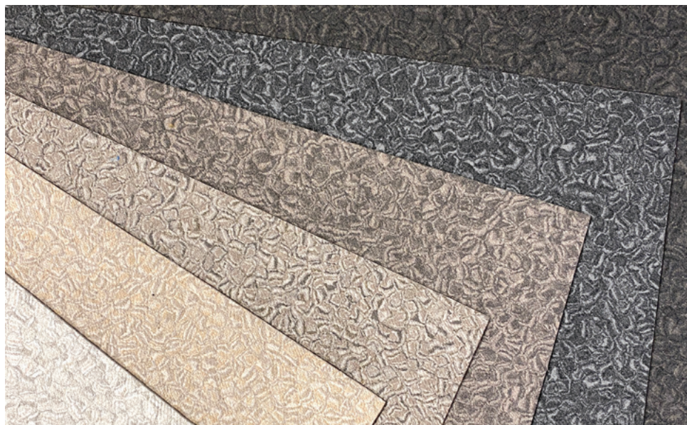
top to bottom: charcoal, carbon, ash, bisque, sand, alabaster

Handmade artistry pairs with high-tech needle-punch processing to create non-woven products that are more like works of art than conventional textiles. Work with our New York based studio to create your own design or build from one of the many patterns within the collections. Designs by Liora Manné can be found in cultural and educational institutions, hotels, restaurants, corporate offices, and residences around the world.