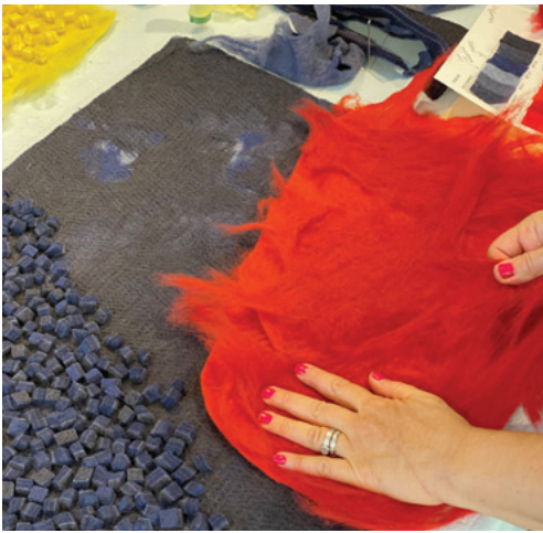
Design begins with a handmade sample, created in our NYC studio at The New York Design Center.